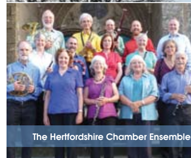
The Herfordshire Chamber Ensemble