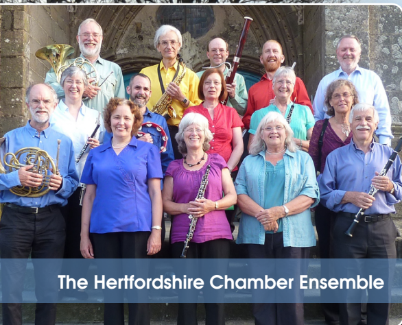
The Hertfordshire Chamber Ensemble