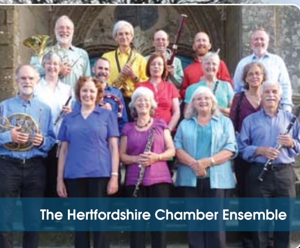
The Hertfordshire Chamber Ensemble